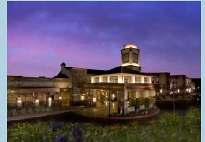
Hilton Scottsdale Resort & Villas

6333 North Scottsdale Road Scottsdale, AZ 85250 Phone: (480) 948-7750 Web: www.hilton.com